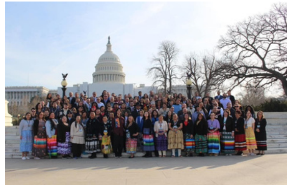
Group photo of participating TCUs students and staff.

Students from RLNC, LLTC and WETC met with Representative Betty McCollum and Senator Amy Klobuchar in their offices on Capitol Hill to discuss why having a Tribal College in their community is important to them and to advocated for necessary and much needed support for TCUs. Each student was able to tell their own personal story and at the same time gain the knowledge and experience in advocating for important issues from within their own communities and bring them to light at a national