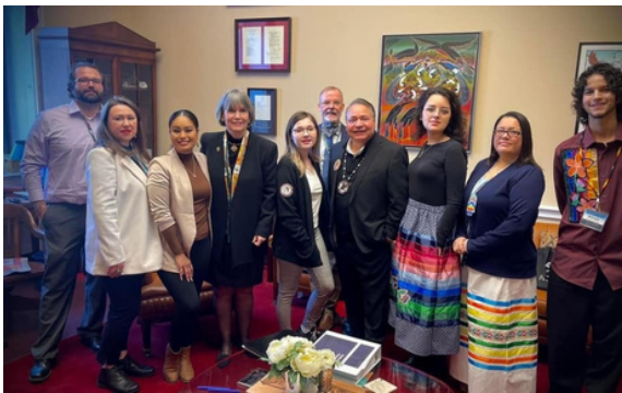
Group photo from Representative McCollum's office visit

Students from RLNC, LLTC and WETC met with Representative Betty McCollum and Senator Amy Klobuchar in their offices on Capitol Hill to discuss why having a Tribal College in their community is important to them and to advocated for necessary and much needed support for TCUs. Each student was able to tell their own personal story and at the same time gain the knowledge and experience in advocating for important issues from within their own communities and bring them to light at a national