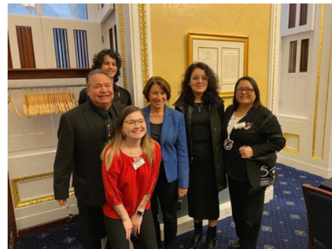
Group photo from Senator Amy Klobuchar's office

It wasn't an always business during their stay in Washington D.C. Students were able to get out and see the historical sights of D. C and have some fun while they were at it. They visited the White House and Capitol Buildings as well as the national monuments and museums. They were also able to get some ice skating in. Below are several more photos from their visit.